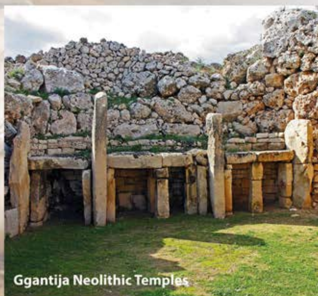
Ggantija Neolithic Temples