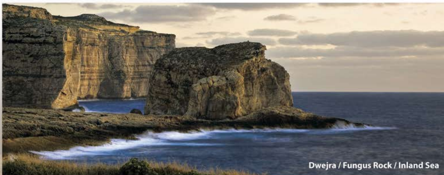
Dwejra / Fungus Rock / Inland Sea