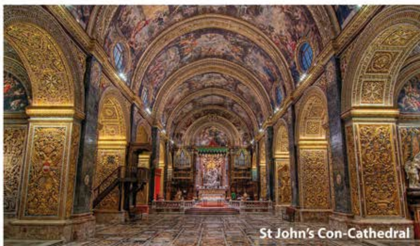
St John's Con-Cathedral